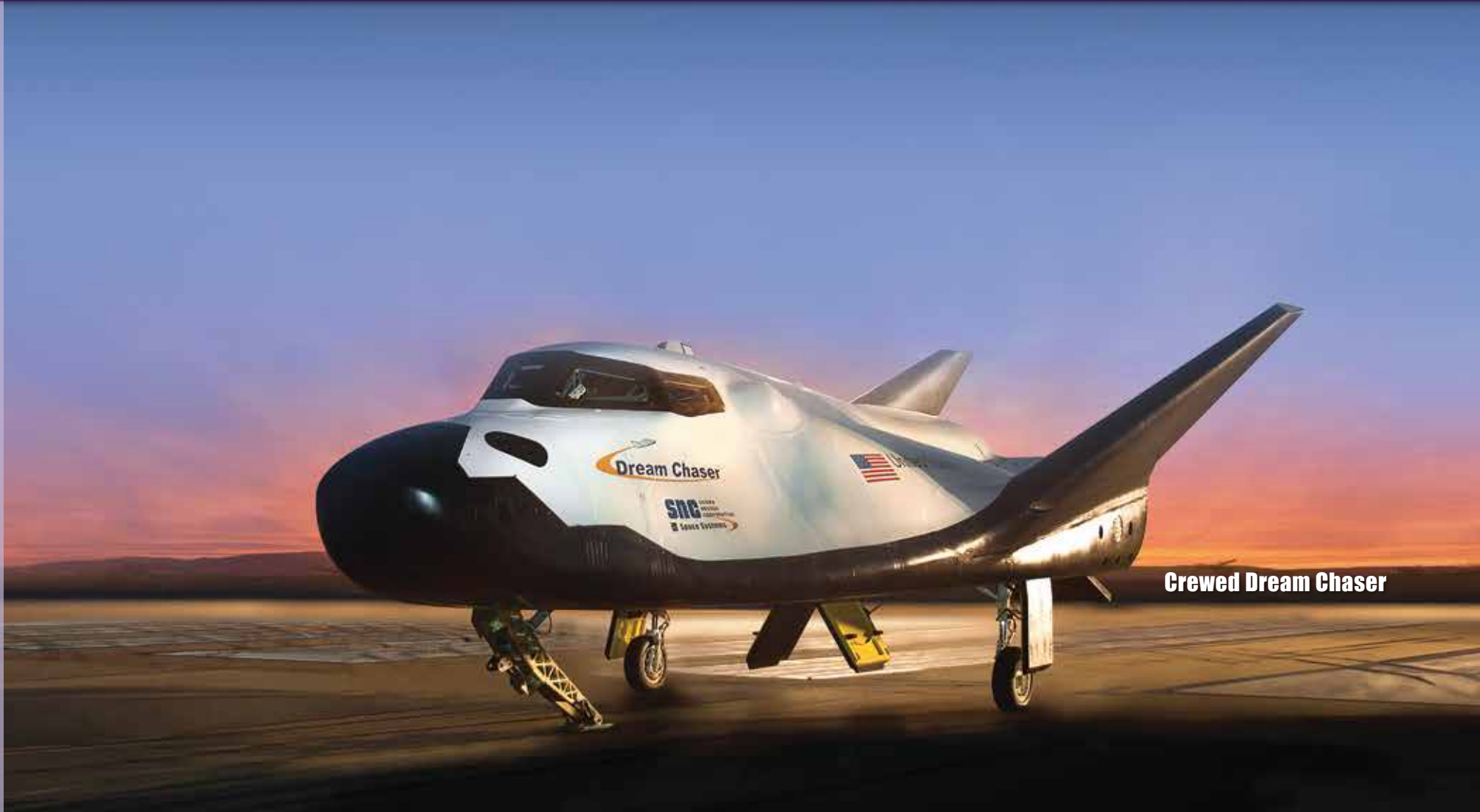
Crewed Dream Chaser